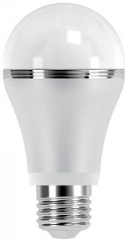
Light Emitting Diode (LED) Light Bulb