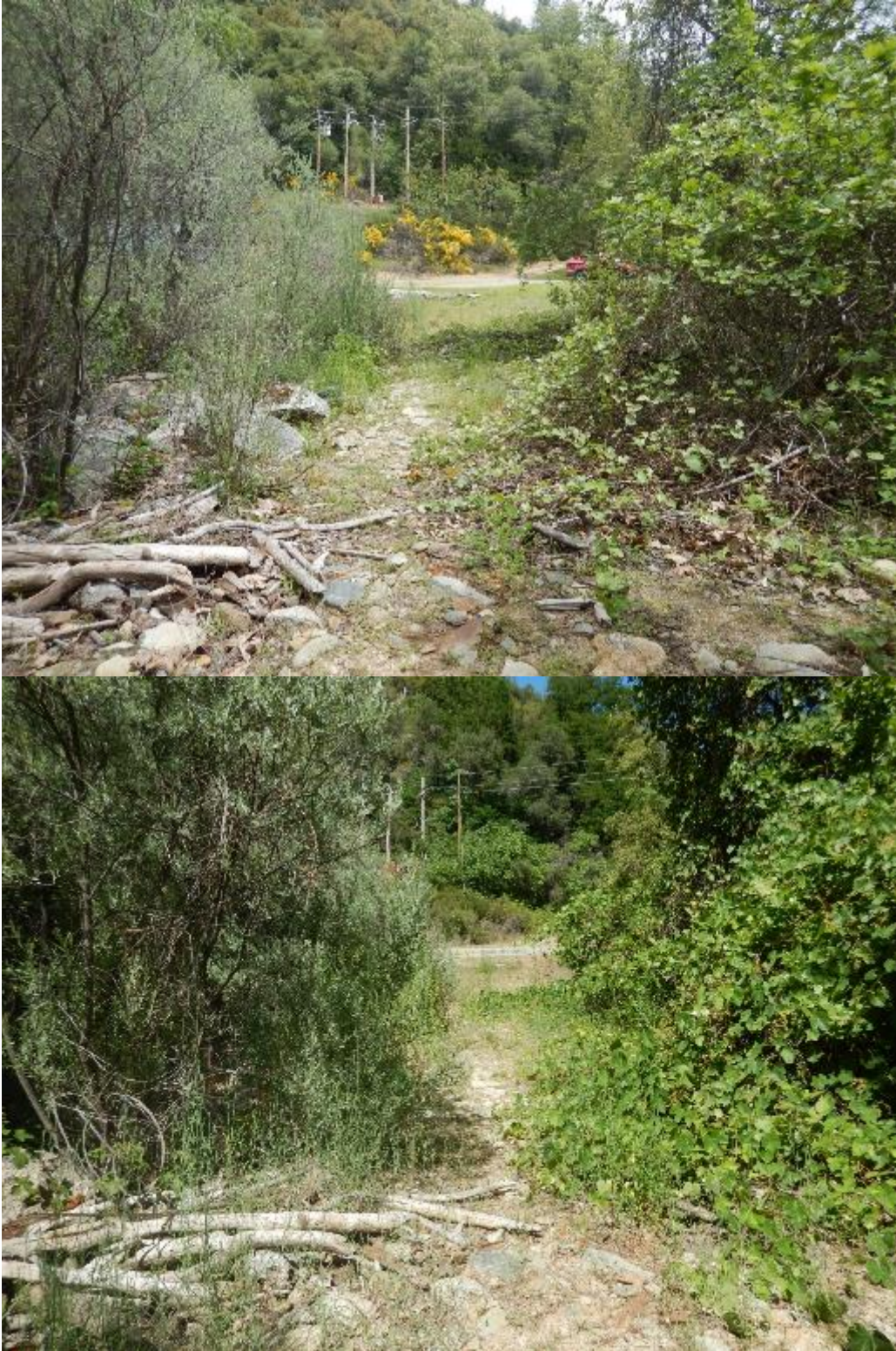
Figure C-10. Trail to take-out for the Slab Creek Run looking away from shoreline, pre-release (top) post-release (bottom) 2018.