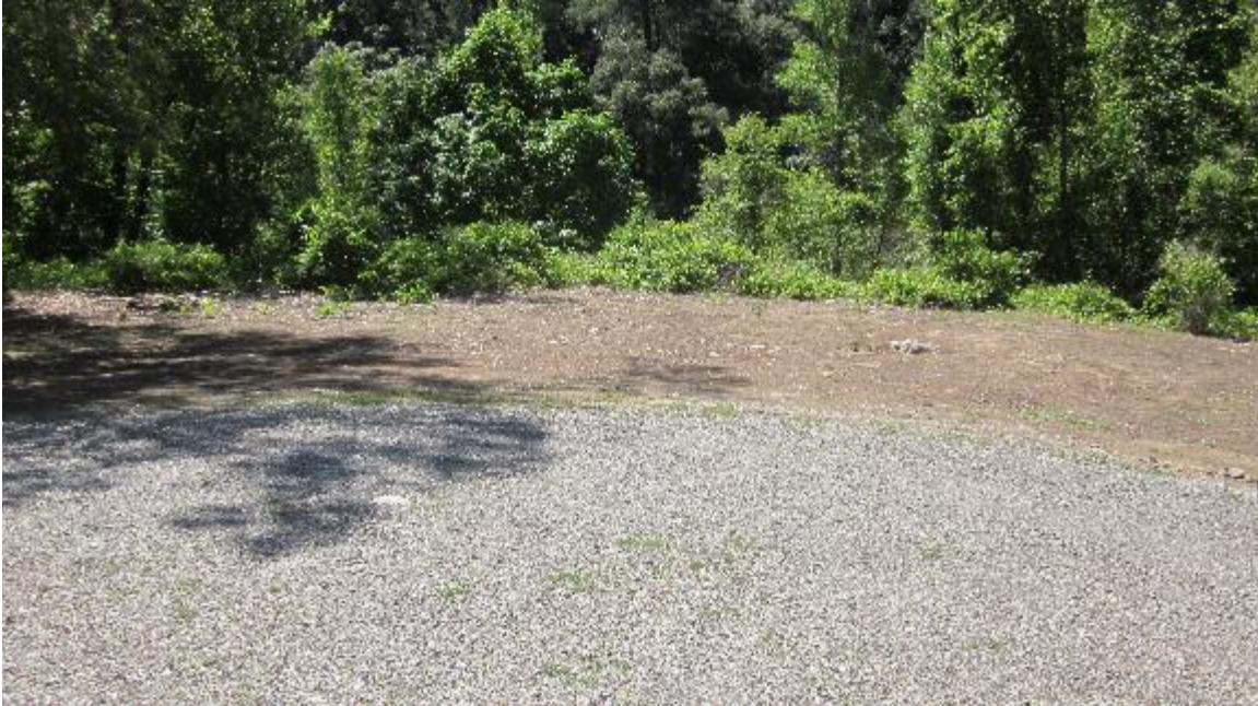
Figure C-5. Parking area at Rock Creek Powerhouse, take-out for the Slab Creek Run looking toward shoreline, post-release (pre-release not obtained) 2016.