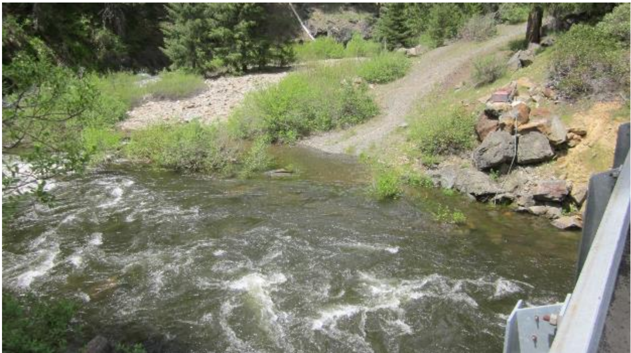
Figure B-4. Ice House Run take-out at Bryant Springs Road Bridge, pre-release (post-release photos were not obtained) 2016.