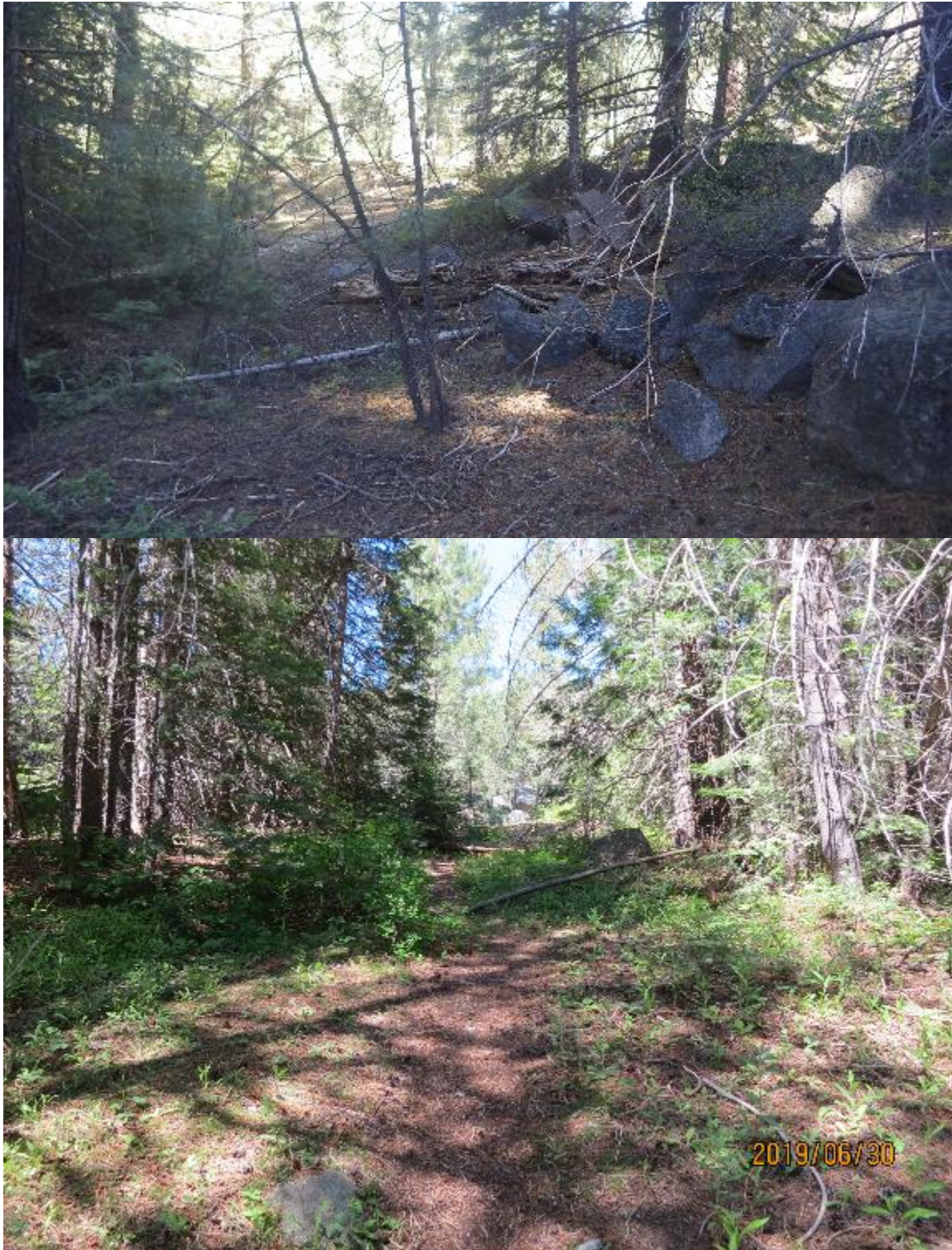
Figure B-21. Trail to Ice House Road Bridge put-in for the Ice House Run looking away from shoreline, pre-release (top) post-release (bottom) 2019.