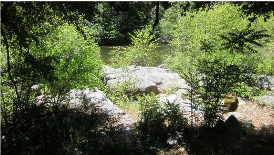
Figure C-4. Shoreline at Rock Creek Powerhouse, take-out for the Slab Creek Run looking toward shoreline, pre-release (top) post-release (bottom) 2016.