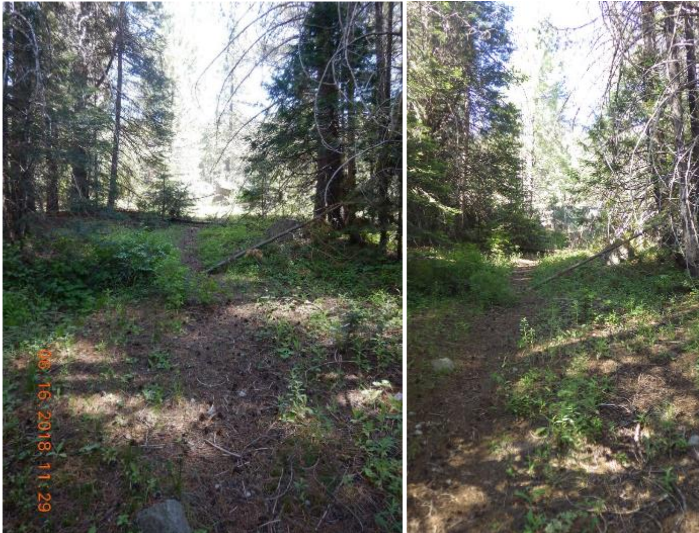
Figure B-12. Trail to Ice House Road Bridge put-in for the Ice House Run looking away from shoreline, pre-release (top) post-release (bottom) 2018.