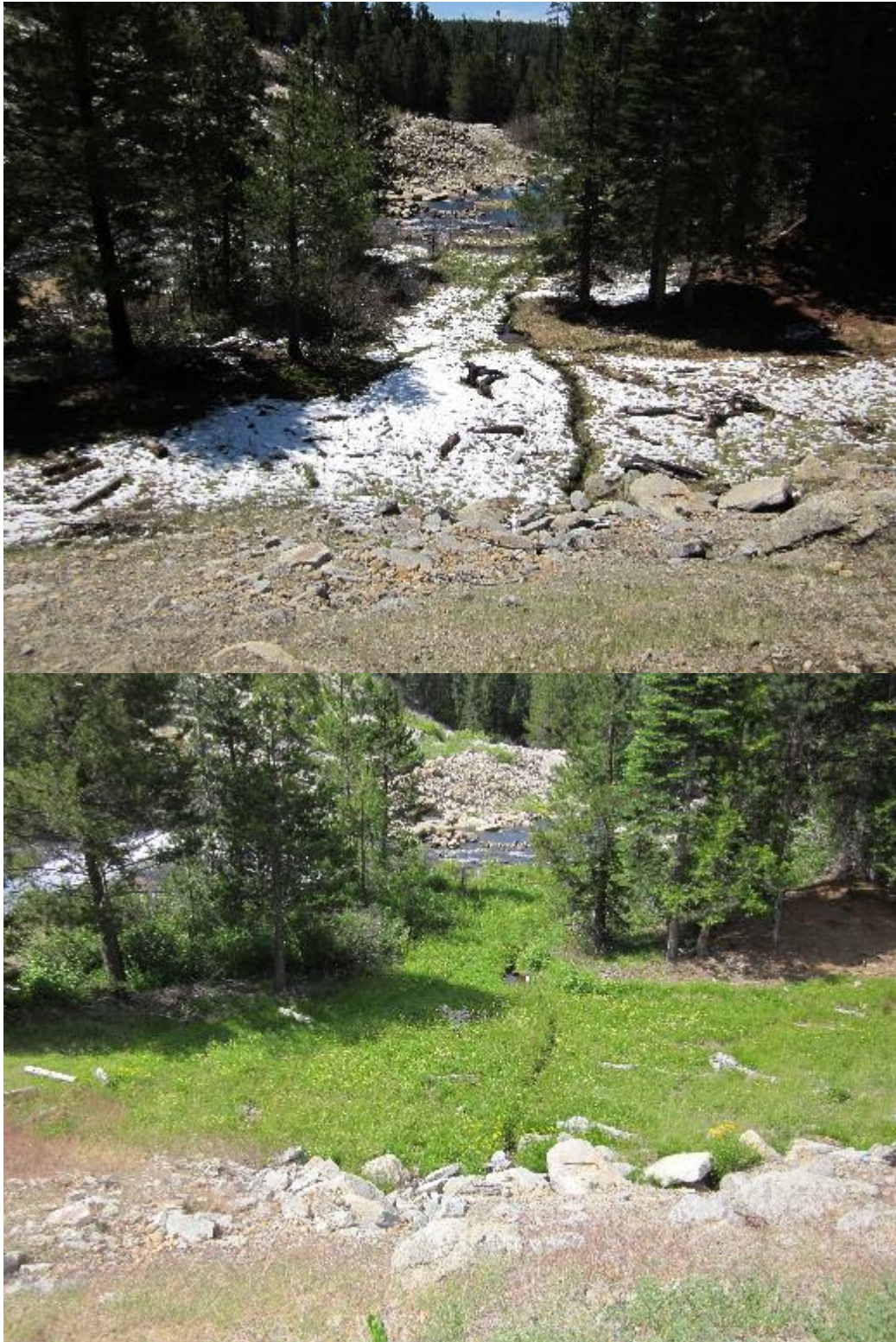
Figure B-1. Ice House Dam put-in for the Ice House Run, pre-release (top) post-release (bottom) 2015.