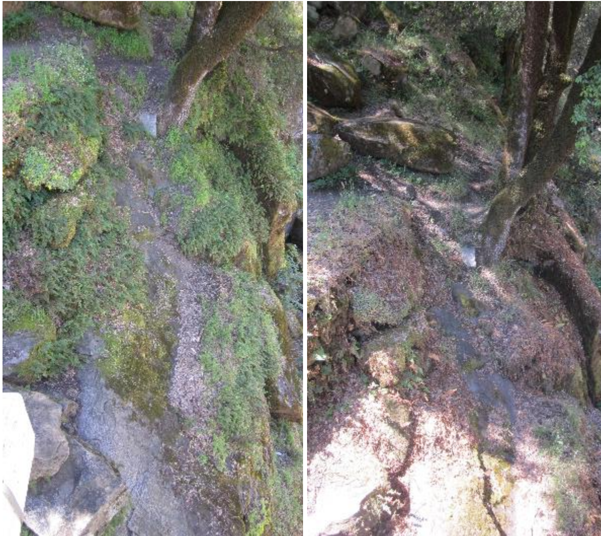
Figure C-2. Trail used for put-in and take-out at Mosquito Bridge for the Slab Creek Run, pre-release (left) post-release (right) 2016.