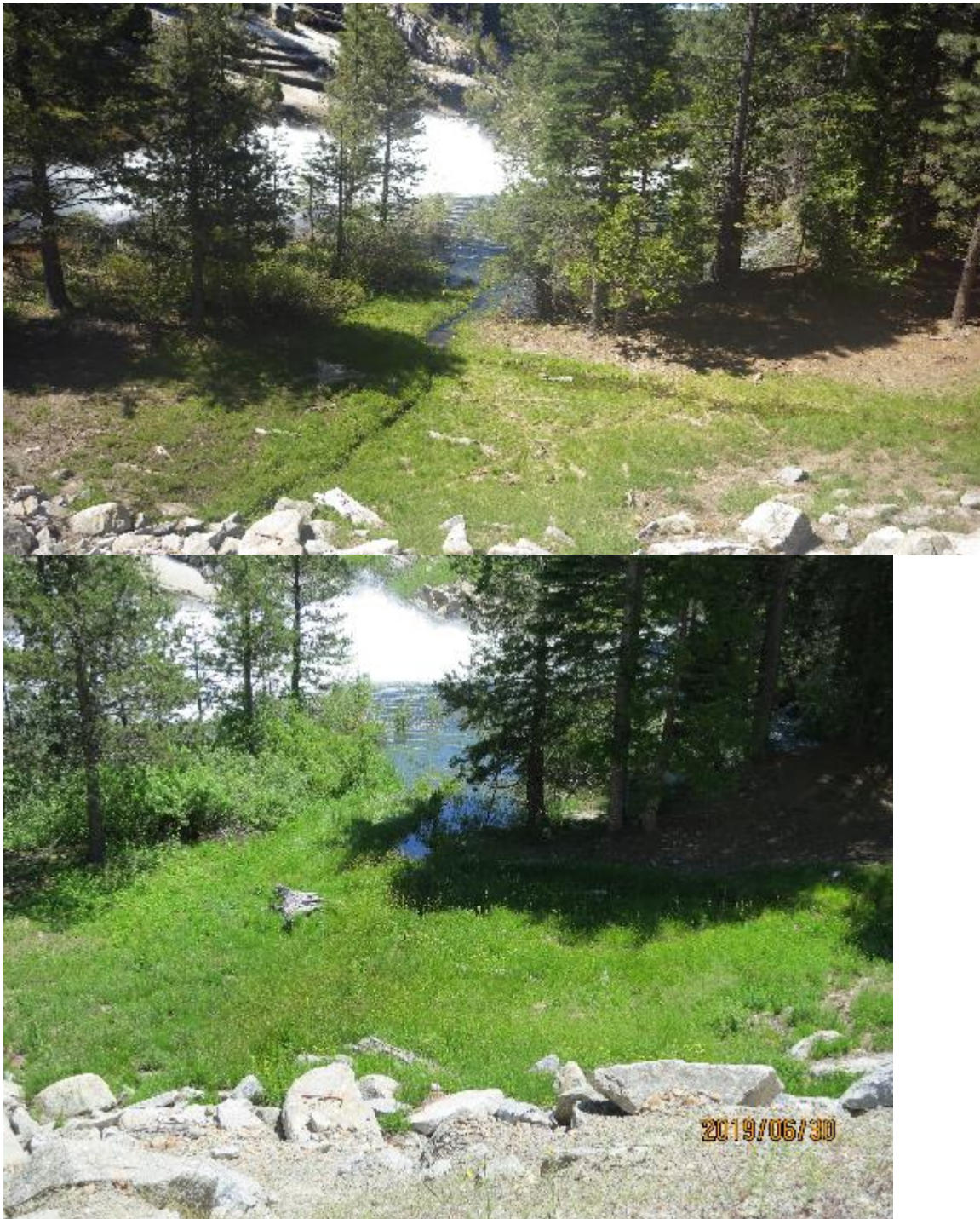
Figure B-17. Ice House Dam put-in for the Ice House Run, pre-release (top) post-release (bottom) 2019.