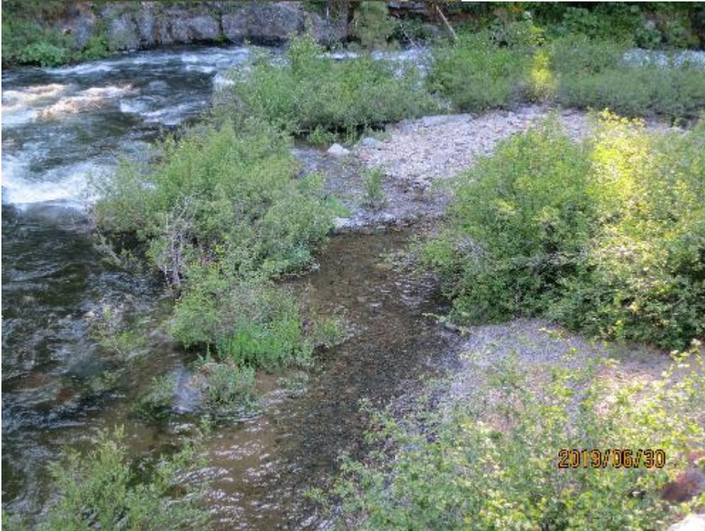
Figure B-23. Ice House Run take-out at Bryant Springs Road Bridge view from bridge, pre-release (top) post-release (bottom) 2019.