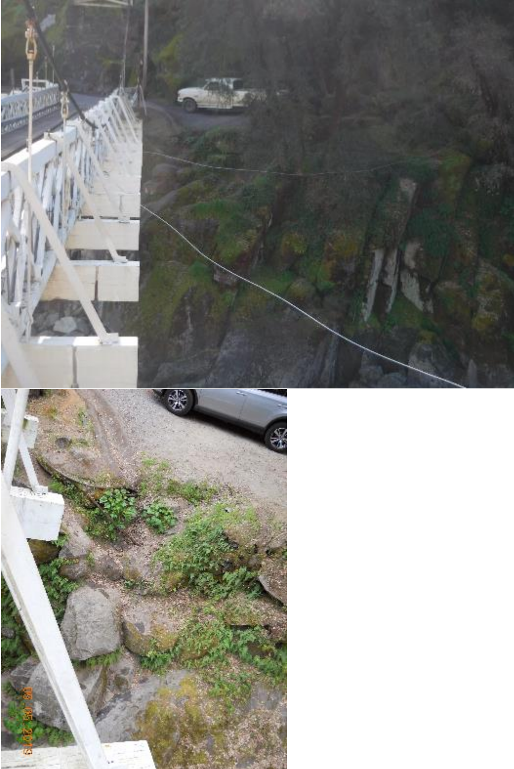
Figure C-13. Trail used for put-in and take-out at Mosquito Bridge for the Slab Creek Run, pre-release (top) post-release (bottom) 2019.