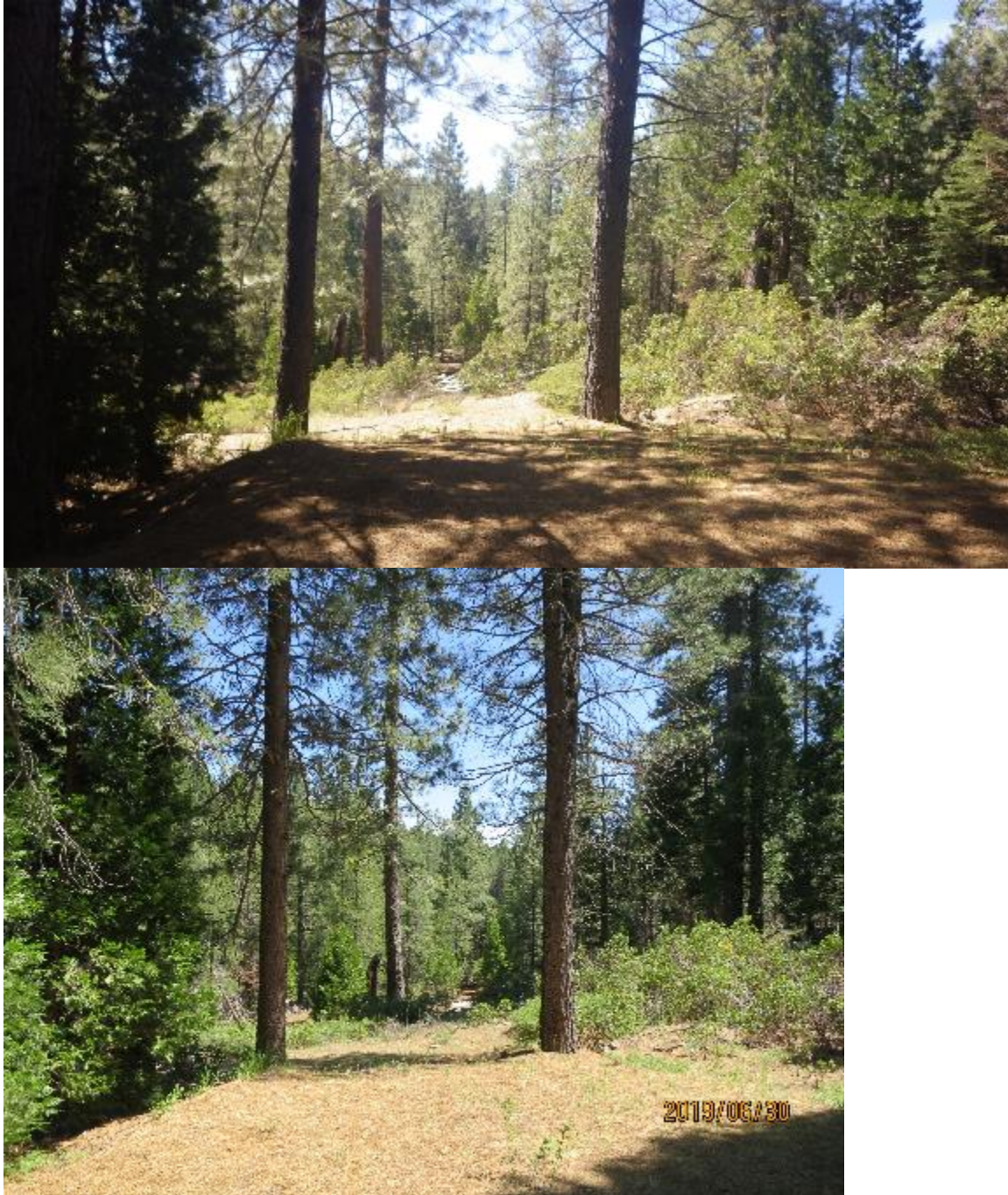
Figure B-19. Ice House Dam alternate put-in for the Ice House Run, pre-release (top) post-release (bottom) 2019.