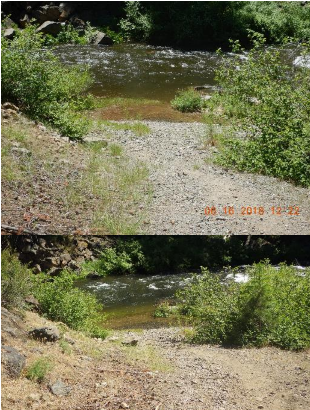
Figure B-15. Ice House Run take-out at Bryant Springs Road Bridge view from road, pre-release (top) post-release (bottom) 2018.