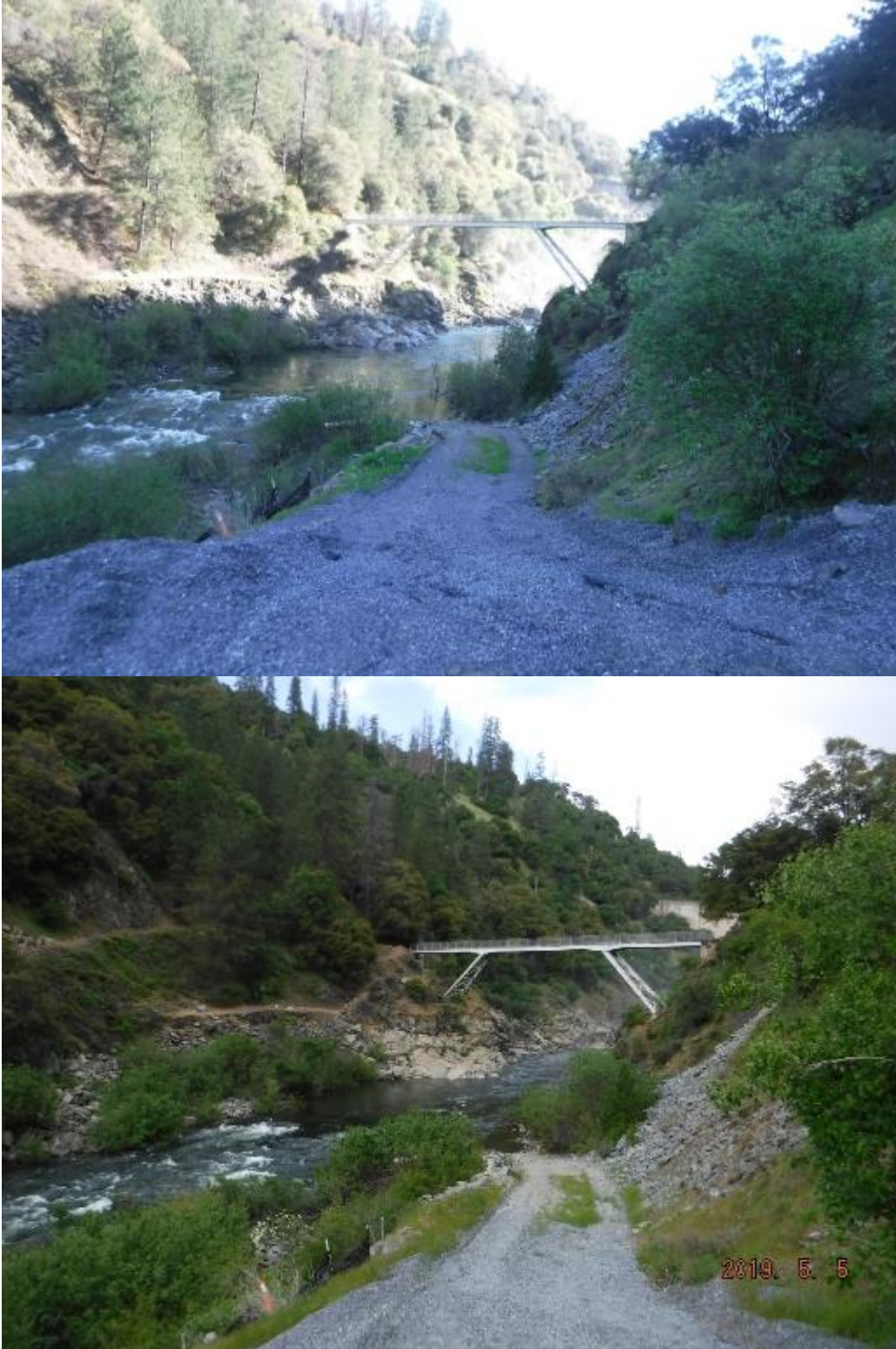
Figure C-12. Trail to Slab Creek Dam put-in for the Slab Creek Dam Run, pre-release (top) post-release (bottom) 2019.