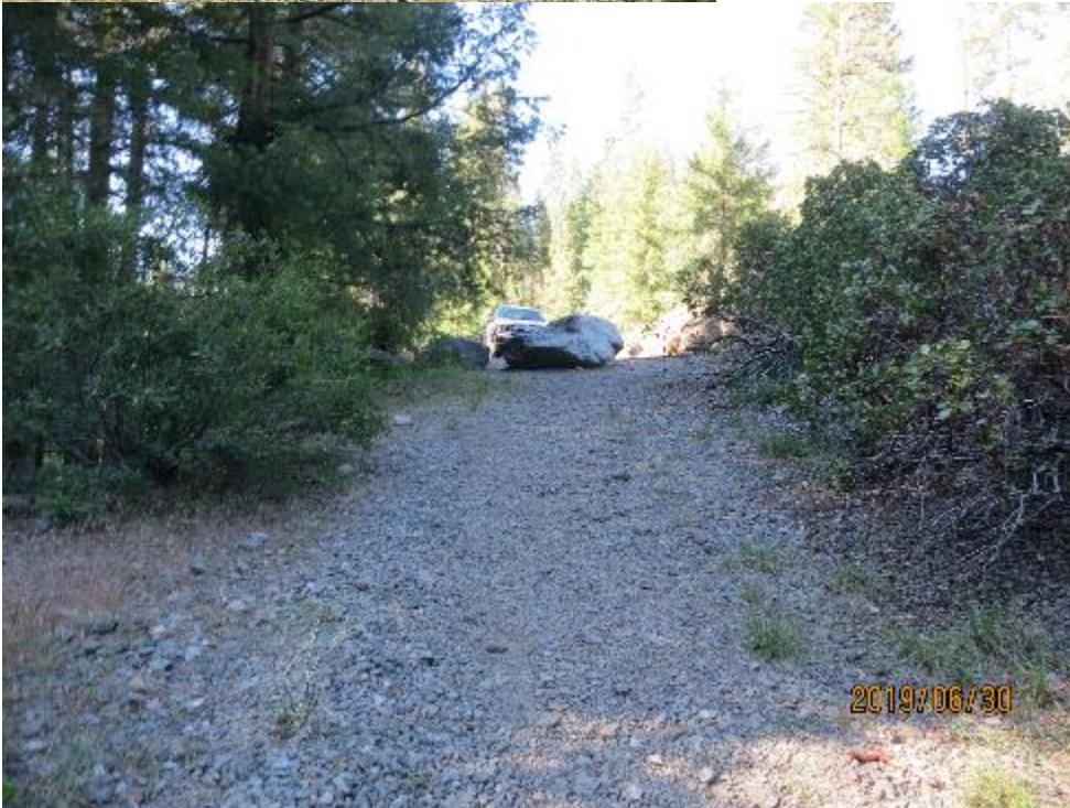
Figure B-25. Ice House Run take-out at Bryant Springs Road Bridge view from shoreline, pre-release (top) post-release (bottom) 2019.