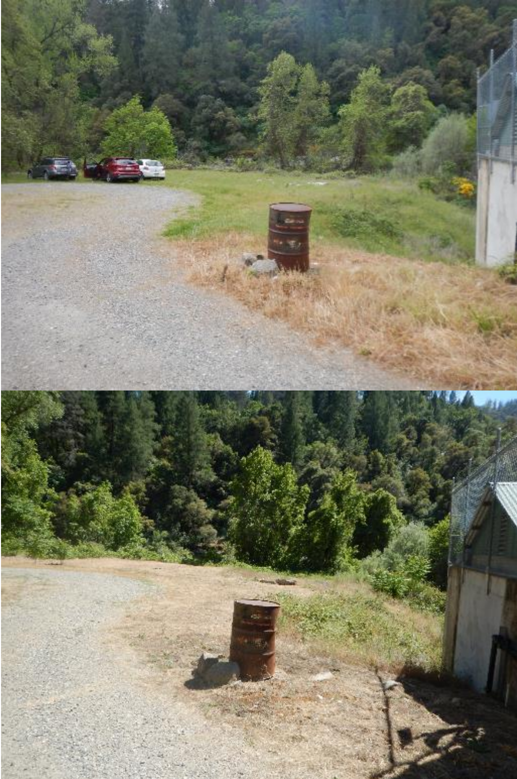
Figure C-11. Parking area at Rock Creek Powerhouse, take-out for the Slab Creek Run looking toward shoreline, pre-release (top) and post-release (bottom) 2018.