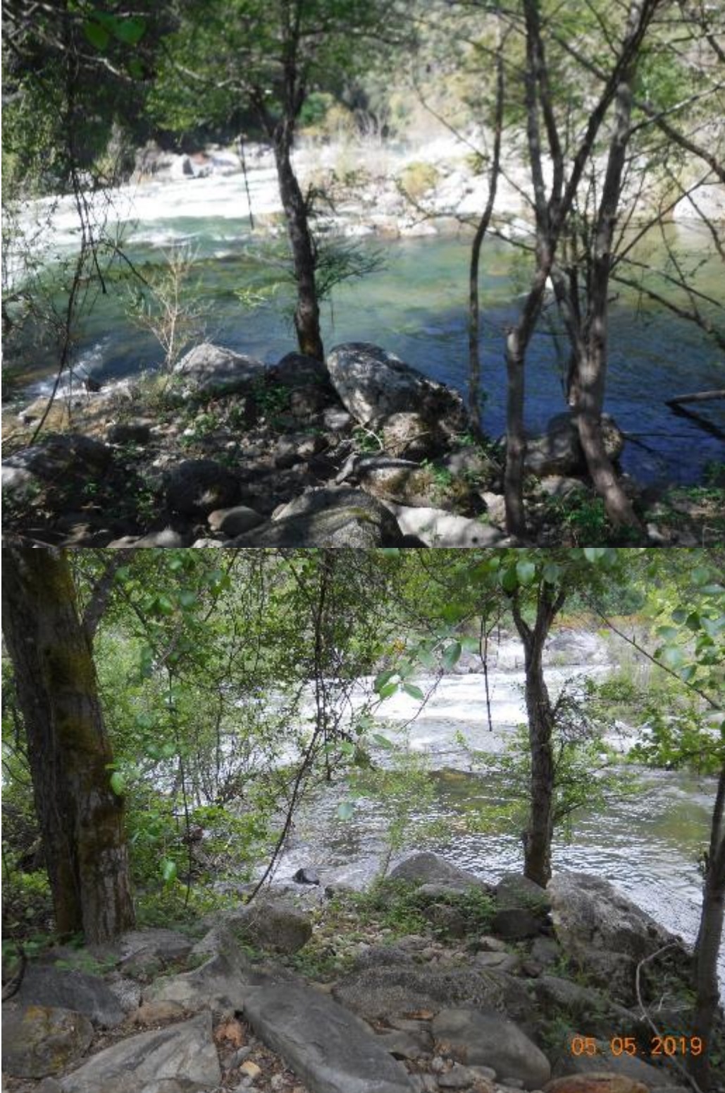
Figure C-15. Confluence of Rock Creek with the South Fork American River used as take-out for the Slab Creek Run, pre-release (top) post-release (bottom) 2019.