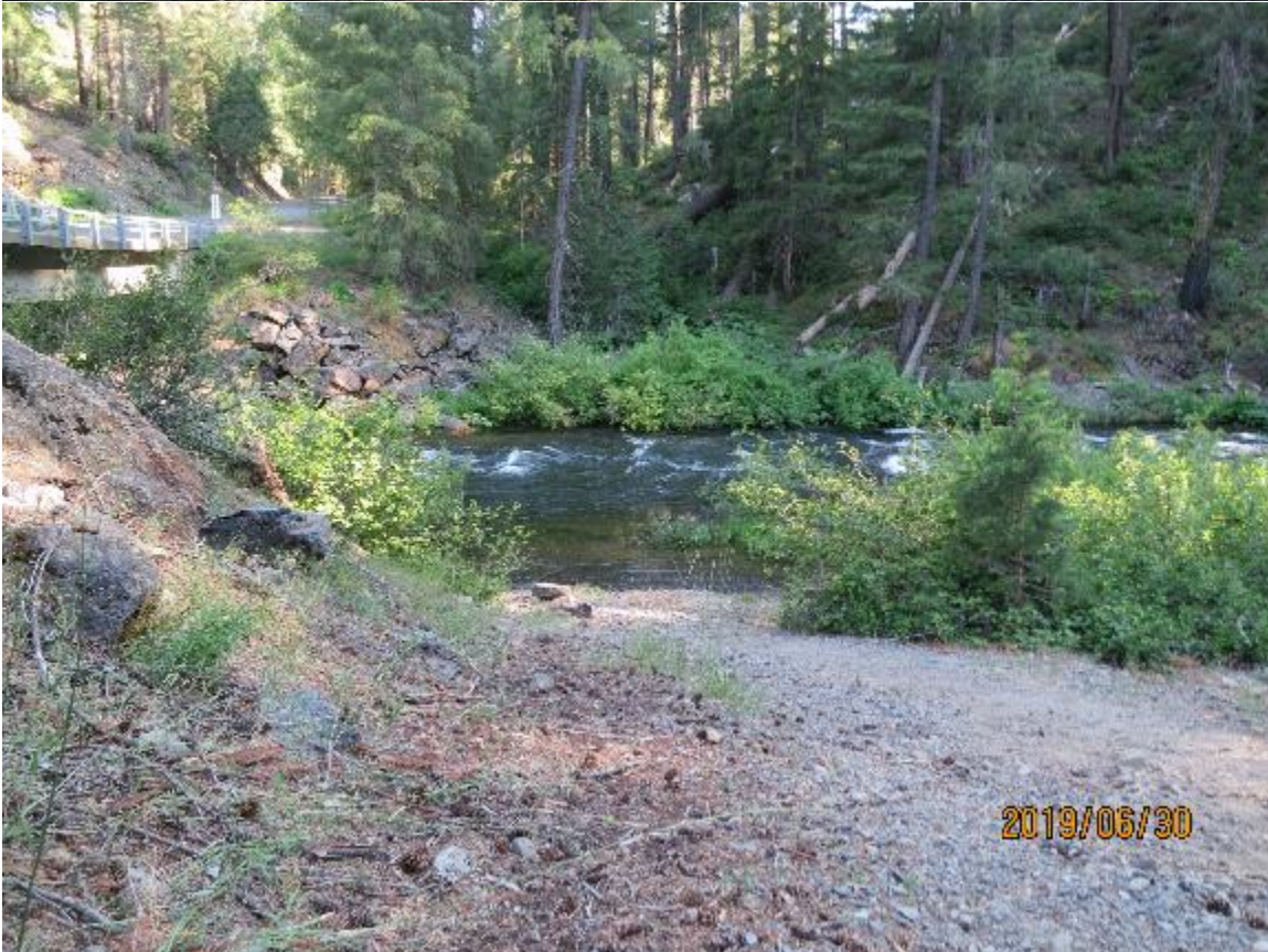
Figure B-24. Ice House Run take-out at Bryant Springs Road Bridge view from road, pre-release (top) post-release (bottom) 2019.