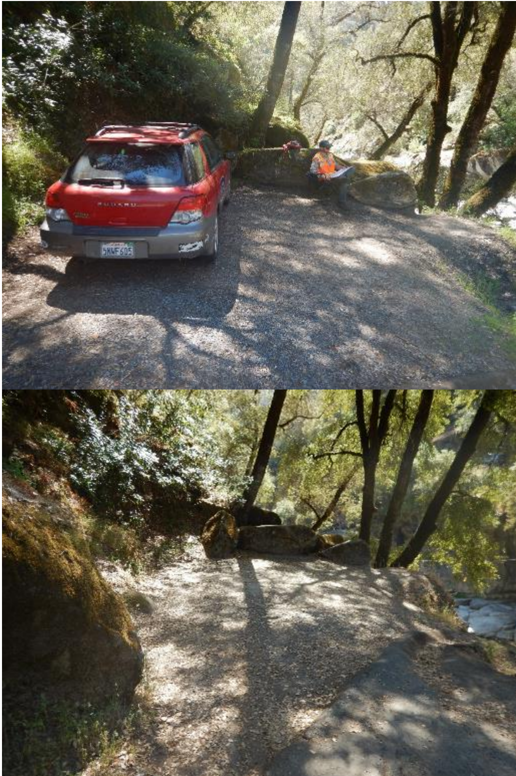
Figure C-8. Staging area at Mosquito Bridge for the Slab Creek Dam Run, pre-release (top) post-release (bottom) 2018.