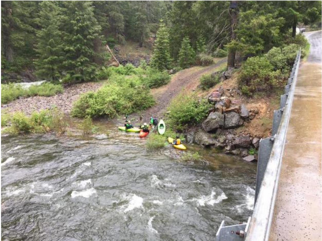
Figure B-7. Ice House Run take-out at Bryant Springs Road Bridge, first release date (post-release photos were not obtained) 2017.