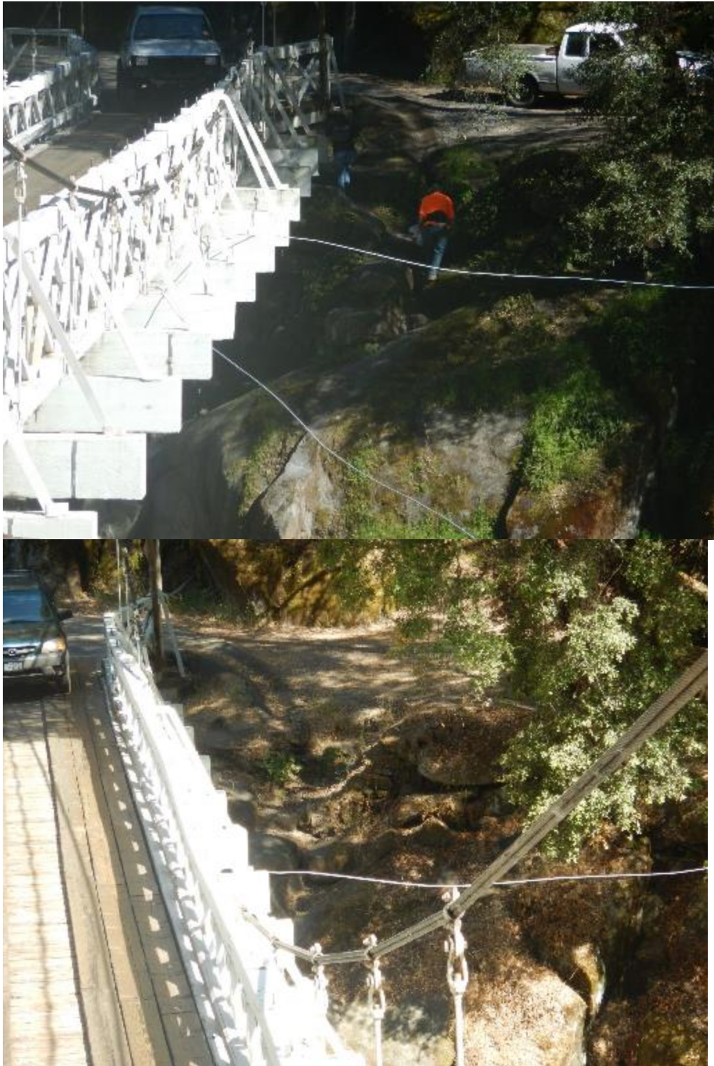
Figure C-7. Trail used for put-in and take-out at Mosquito Bridge for the Slab Creek Run, pre-release (top) post-release (bottom) 2018.