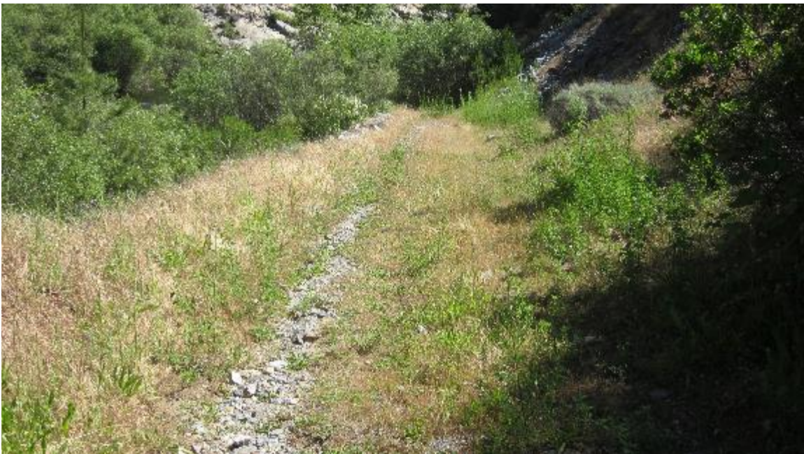
Figure C-1. Trail to Slab Creek Dam put-in for the Slab Creek Dam Run looking toward shoreline, pre-release (top) post-release (bottom) 2016.