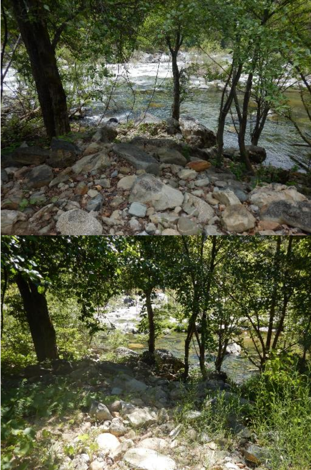
Figure C-9. Confluence of Rock Creek with South Fork American River used as take-out for the Slab Creek Run, pre-release (top) post-release (bottom) 2018.