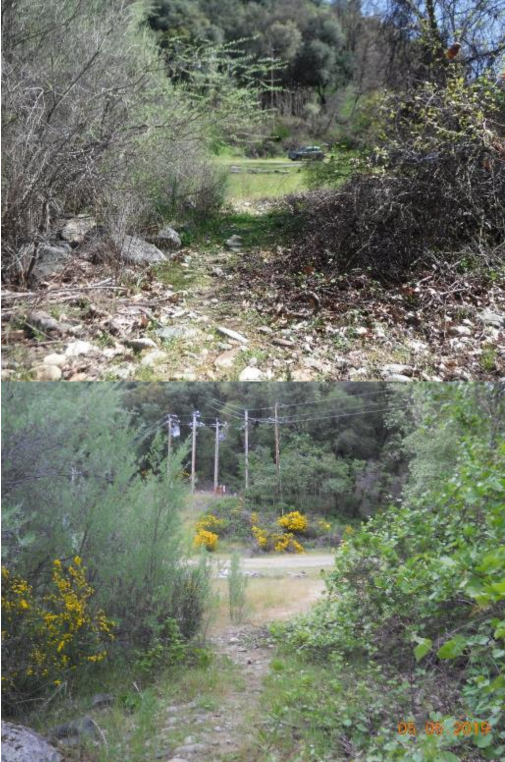
Figure C-16. Trail to take-out for the Slab Creek Run looking away from shoreline, pre-release (top) post-release (bottom) 2019.