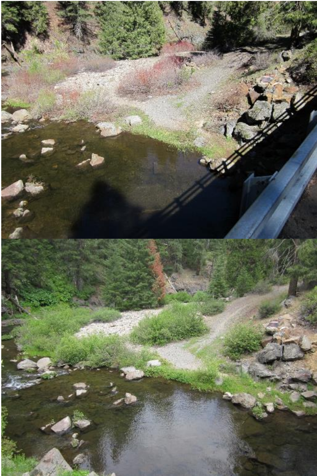
Figure B-2. Ice House Run take-out at Bryant Springs Road Bridge, pre-release (top) post-release (bottom) 2015.