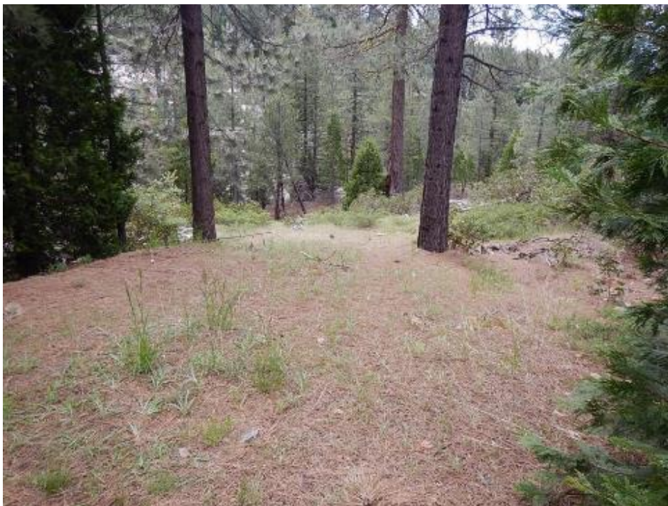
Figure B-6. Ice House Dam alternate put-in for the Ice House Run, first release date (post-release photos were not obtained) 2017.