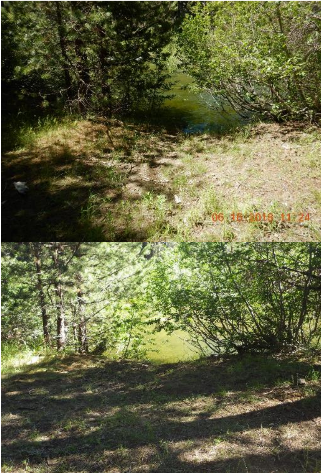
Figure B-13. Shoreline at Ice House Road Bridge put-in for the Ice House Run, pre-release (top) post-release (bottom) 2018.