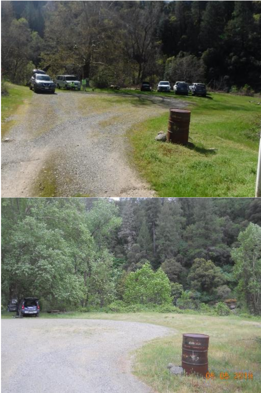
Figure C-17 Parking area at Rock Creek Powerhouse, take-out for the Slab Creek Run looking toward shoreline, pre-release (top) and post-release (bottom) 2019.