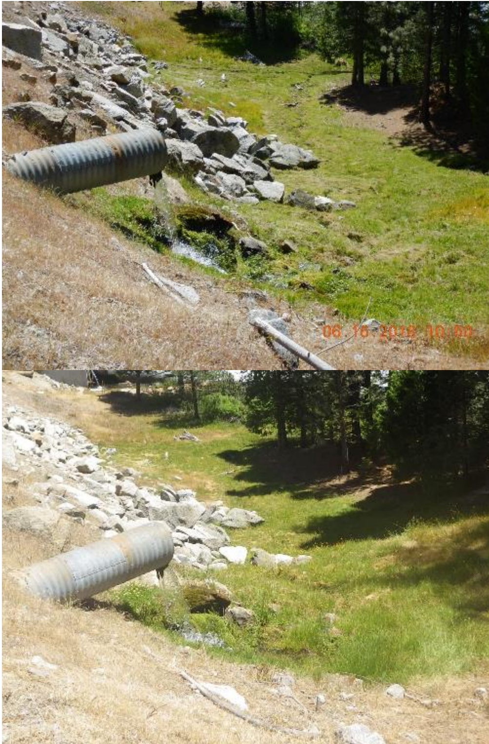
Figure B-9. Put-in for the Ice House Run looking toward the valve house, pre-release (top) post-release (bottom) 2018.