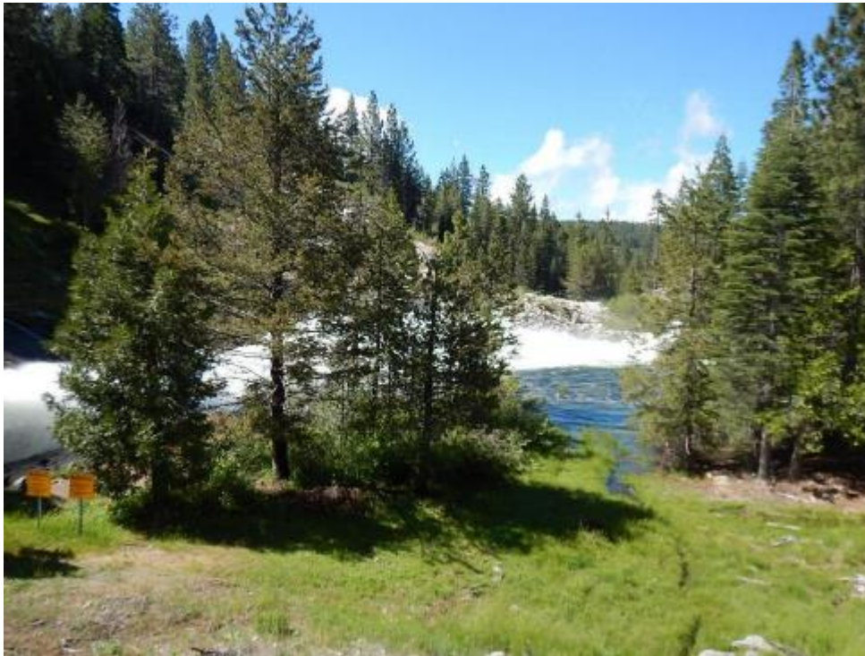
Figure B-5. Ice House Dam put-in for the Ice House Run, first release date (post-release photos were not obtained) 2017.