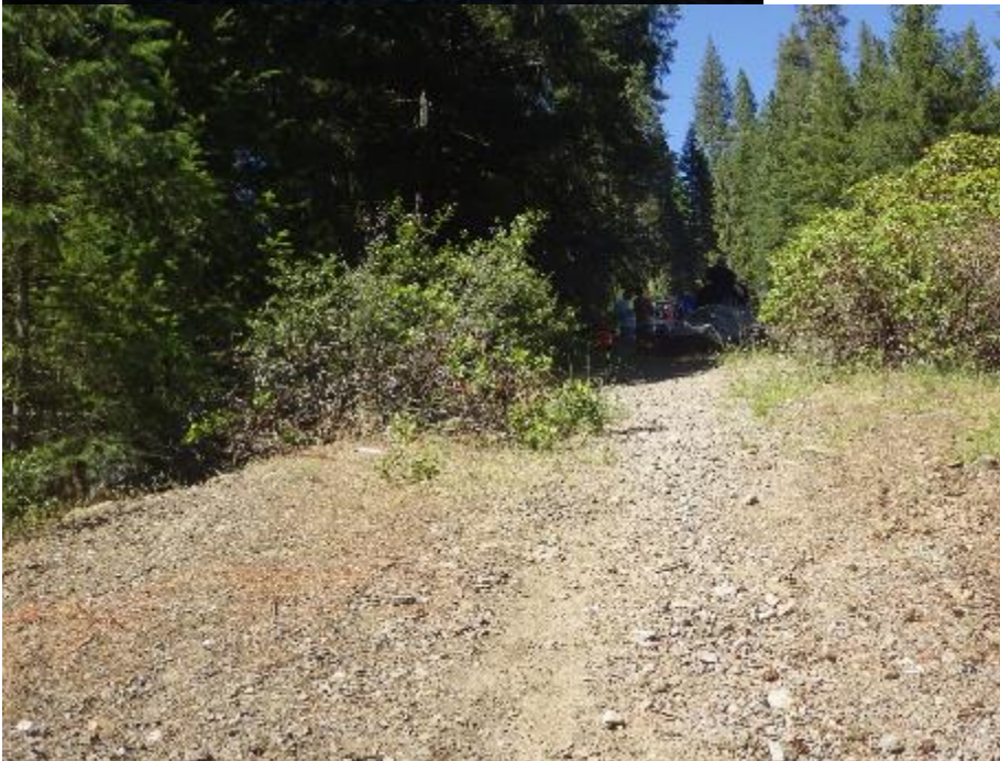
Figure B-16. Ice House Run take-out at Bryant Springs Road Bridge view from shoreline, pre-release (top) post-release (bottom) 2018.