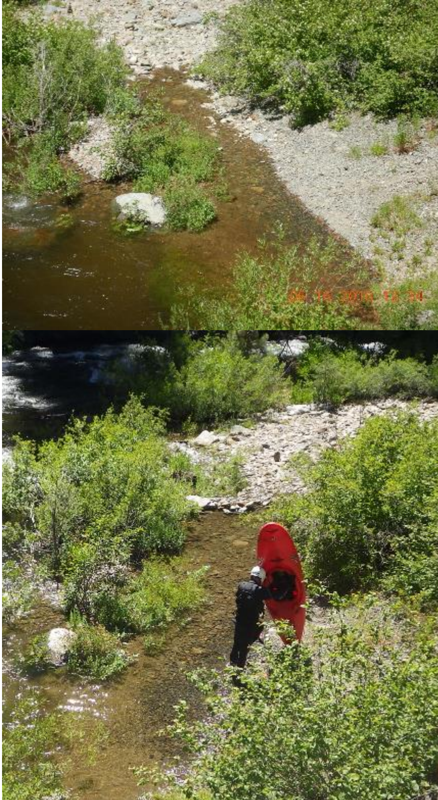
Figure B-14. Ice House Run take-out at Bryant Springs Road Bridge view from bridge, pre-release (top) post-release (bottom) 2018.