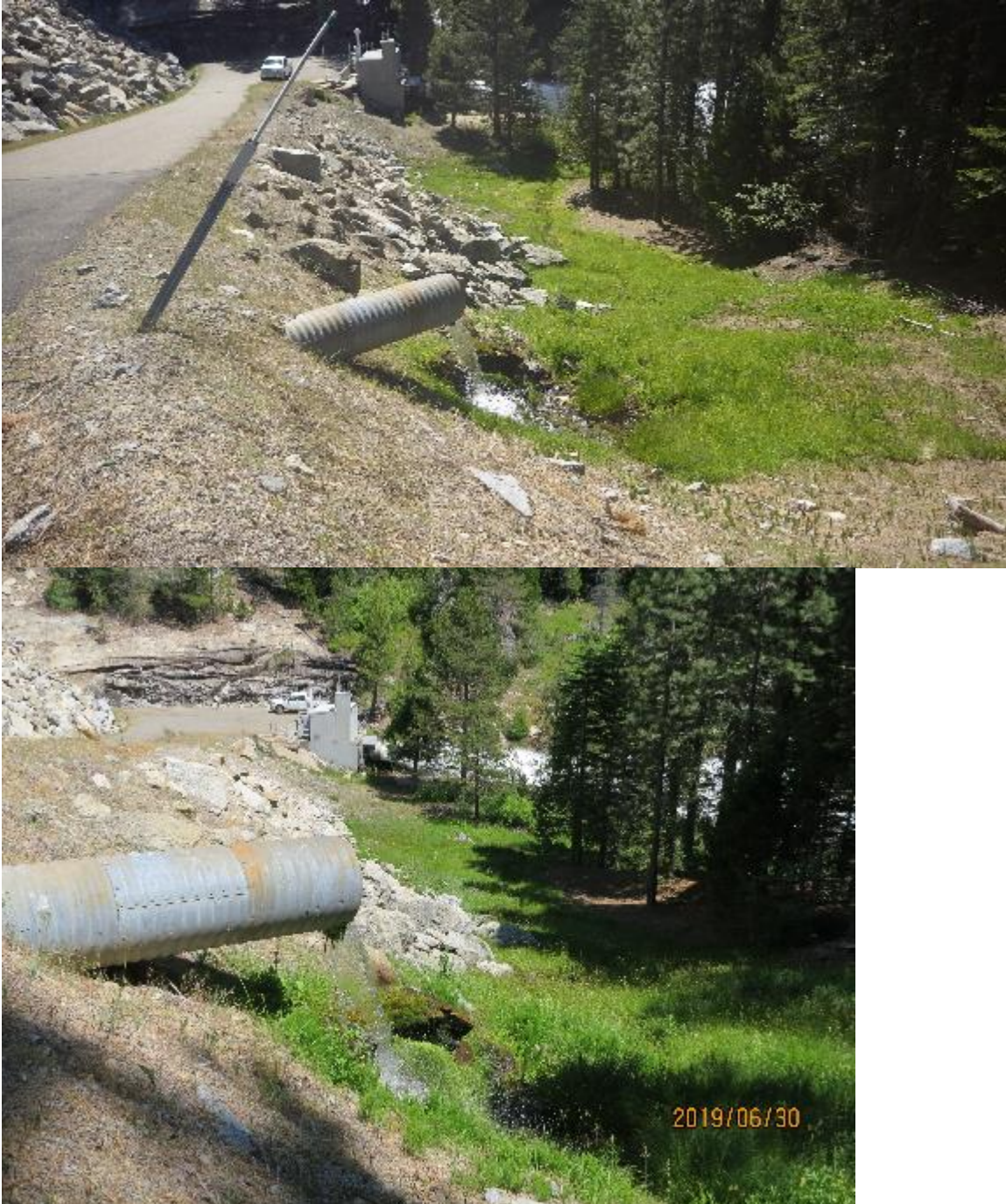
Figure B18. Put-in for the Ice House Run looking toward the valve house, pre-release (top) post-release (bottom) 2019.