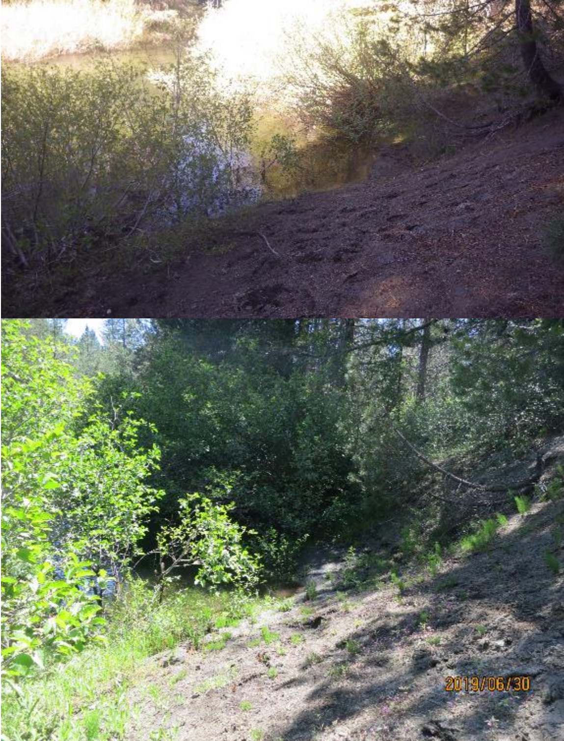
Figure B-22. Shoreline at Ice House Road Bridge put-in for the Ice House Run, pre-release (top) post-release (bottom) 2019.