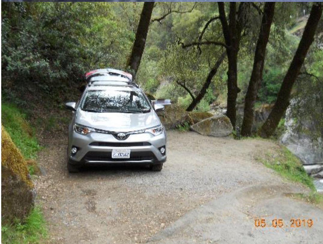
Figure C-14. Staging area at Mosquito Bridge for the Slab Creek Dam Run, pre-release (top) post-release (bottom) 2019.