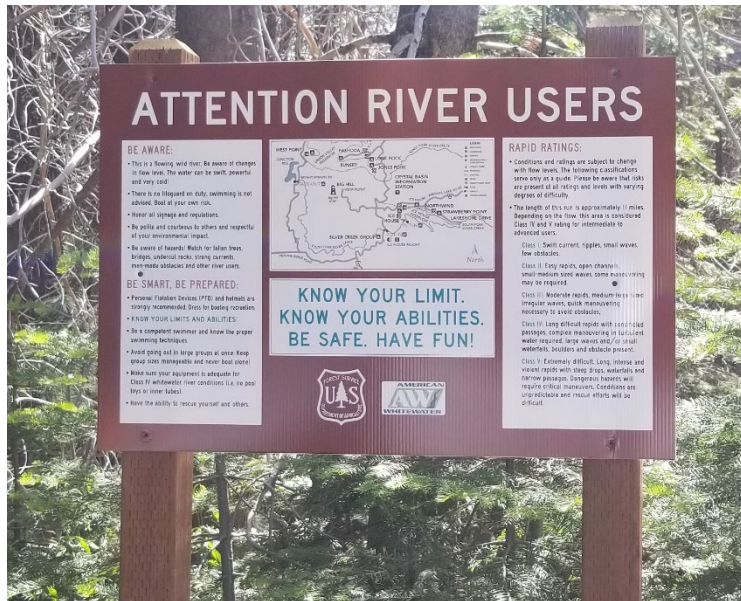
Figure 3. Forest Service boater safety sign located at Ice House Day Use Area near the west dam abutment (point of access to the designated put-in for the Ice House Run)