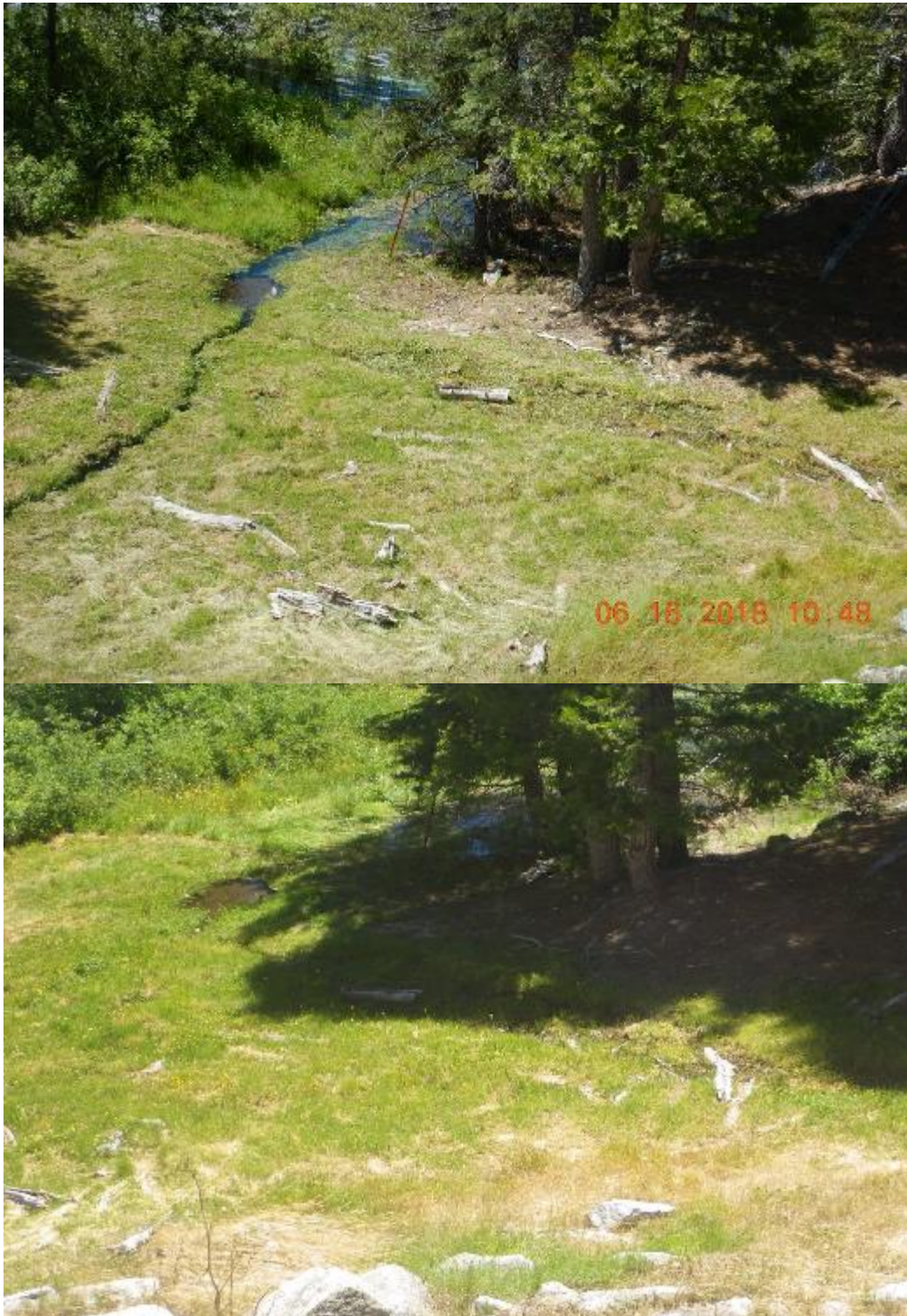
Figure B-8. Ice House Dam put-in for the Ice House Run, pre-release (top) post-release (bottom) 2018.