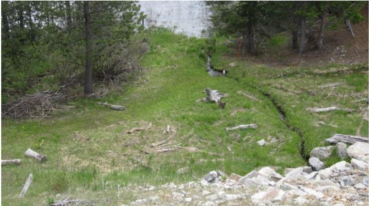
Figure B-3. Ice House Dam put-in for the Ice House Run, pre-release (post-release photos were not obtained) 2016.