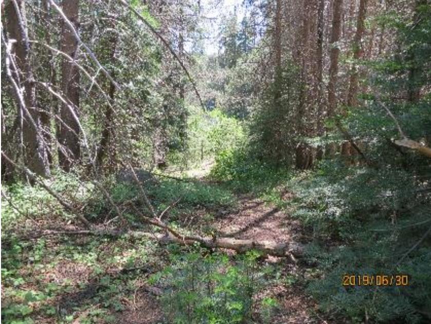
Figure B-20. Trail to Ice House Road Bridge put-in for the Ice House Run looking toward shoreline, pre-release (top) post-release (bottom) 2019.