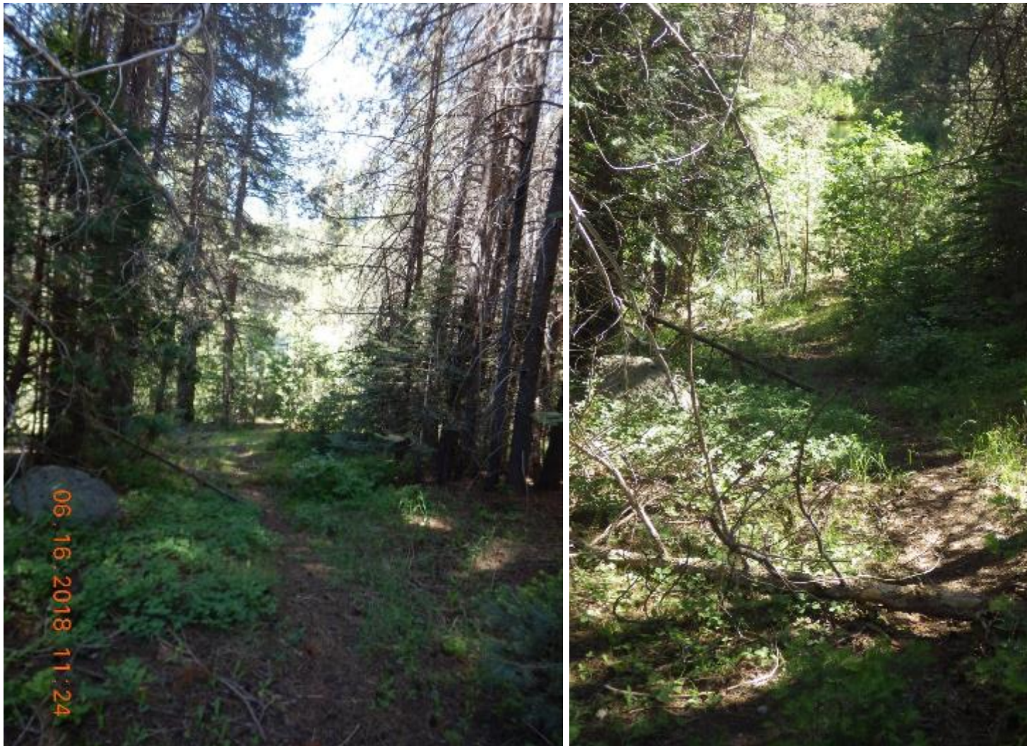
Figure B-11. Trail to Ice House Road Bridge put-in for the Ice House Run looking toward shoreline, pre-release (top) post-release (bottom) 2018.