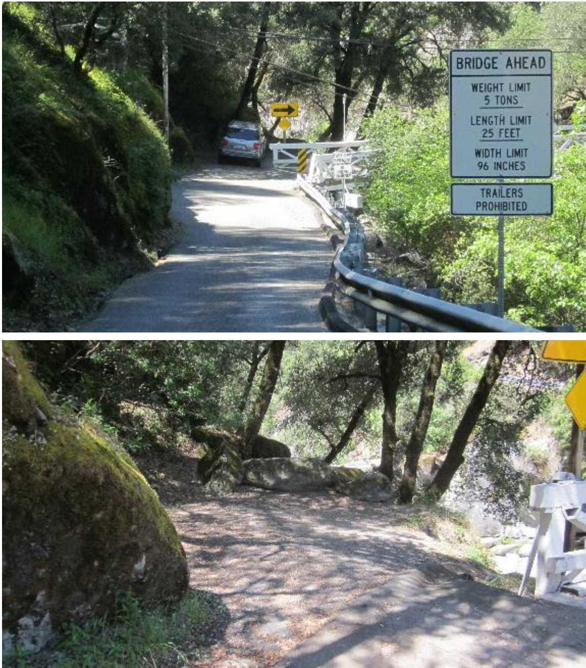
Figure C-3. Staging area at Mosquito Bridge for the Slab Creek Dam Run, pre-release (top) post-release (bottom) 2016.