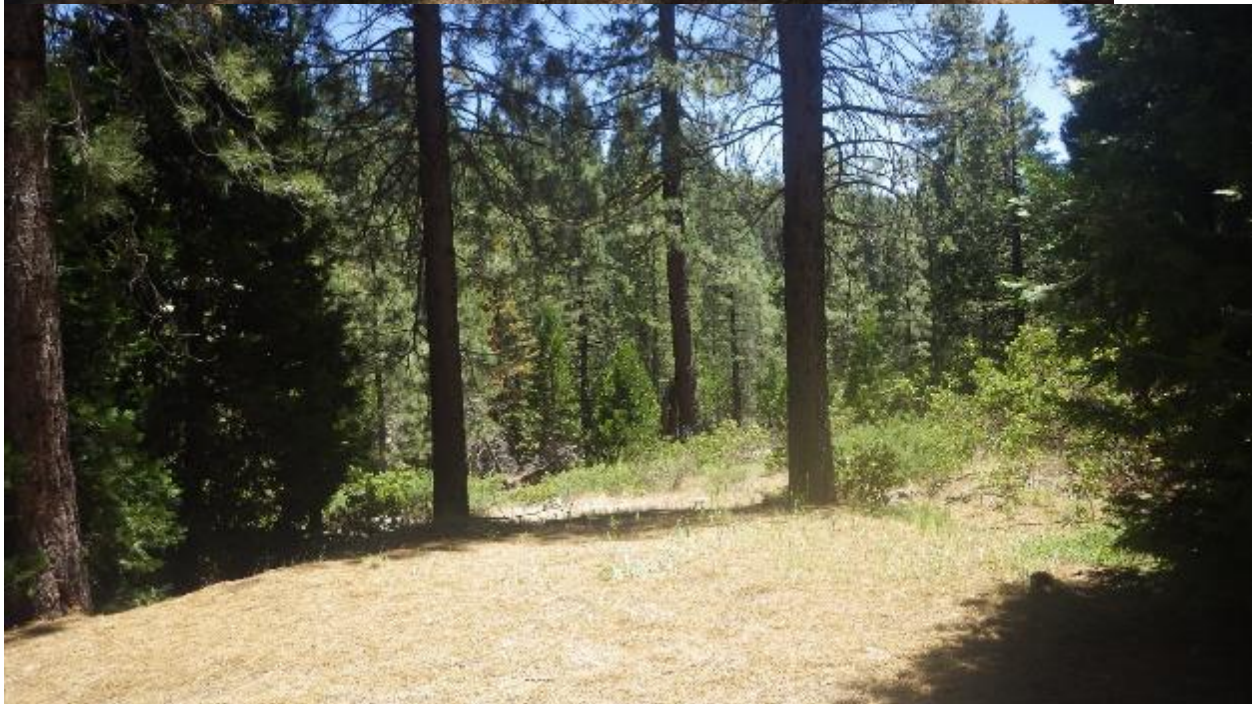
Figure B-10. Ice House Dam alternate put-in for the Ice House Run, pre-release (top) post-release (bottom) 2018.