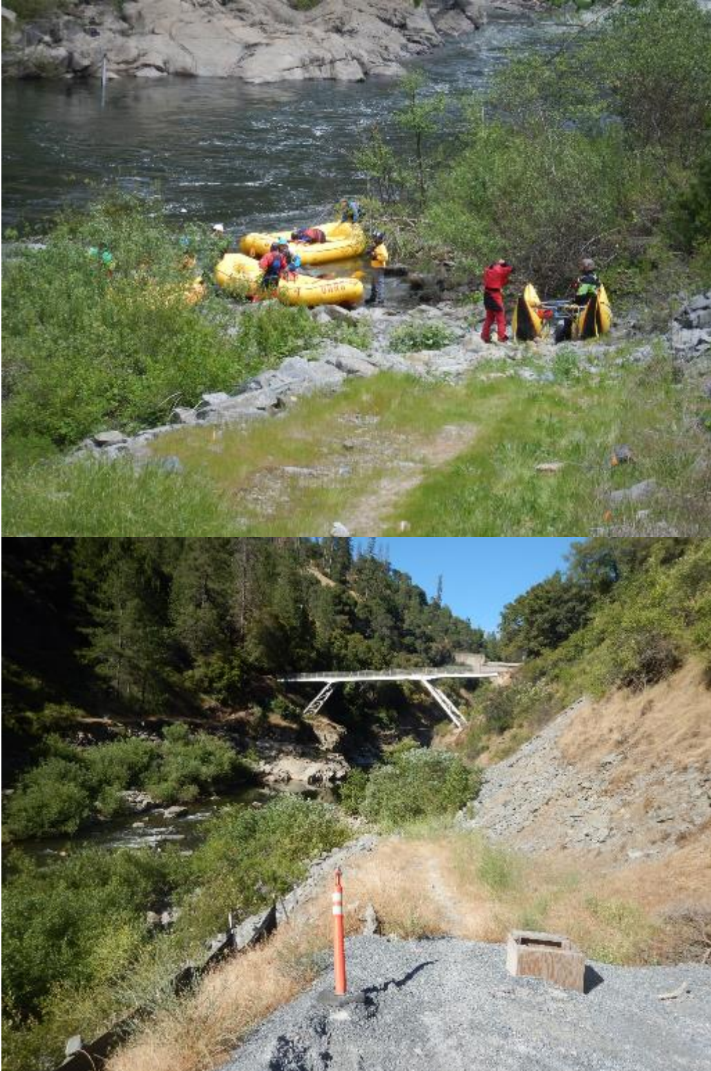
Figure C-6. Trail to Slab Creek Dam put-in for the Slab Creek Dam Run, pre-release (top) post-release (bottom) 2018.