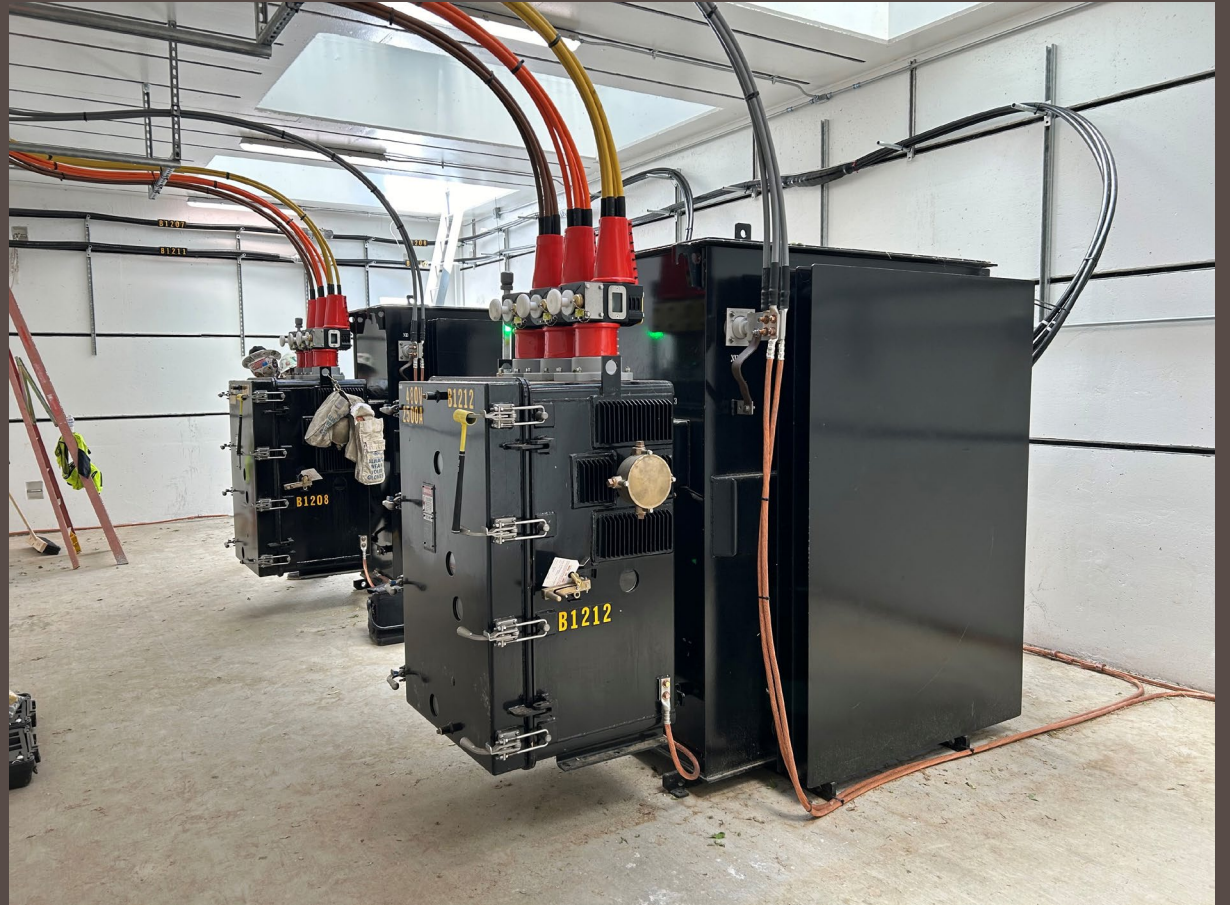
9000V Vault that supports the Library Courts Building across from the Capitol

These transformers are replacing pre-1990 transformers to continue our high reliability