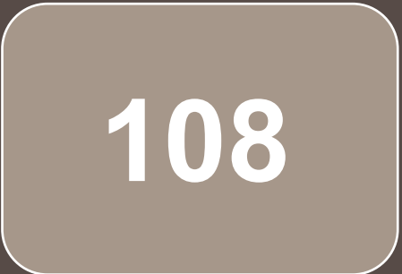
Mentor Matches for Startup Founders