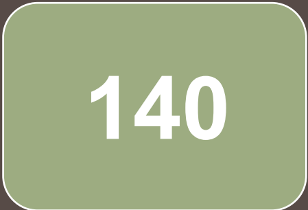
Cohort or Accelerator Participants