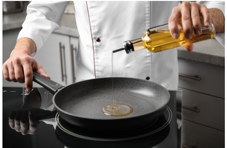
Maintain precise control over cooking with induction cooktops.