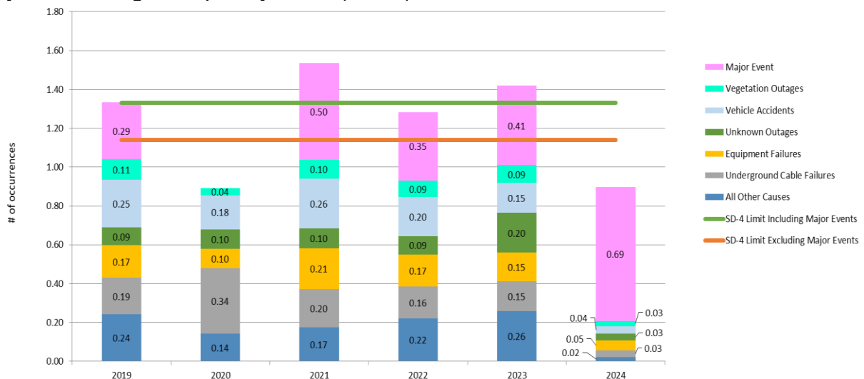
Graph 1: Multi-Year Comparison System Average Frequency Index (SAIFI)

The graphs below provide a five-year comparison of the impacts of outage causes to the average frequency (SAIFI) and duration (SAIDI) of outages. 2024 SAIDI and SAIFI are year-to-date through Apr. 30, 2024.