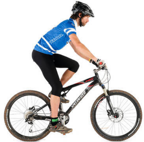
Ride a bike.