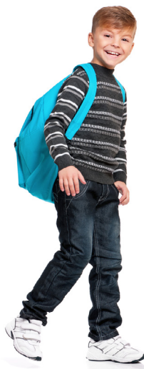
Walk to school.

When appropriate, save energy by using public transportation, riding your bike, or walking.