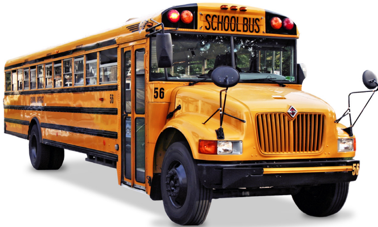
Ride the bus.