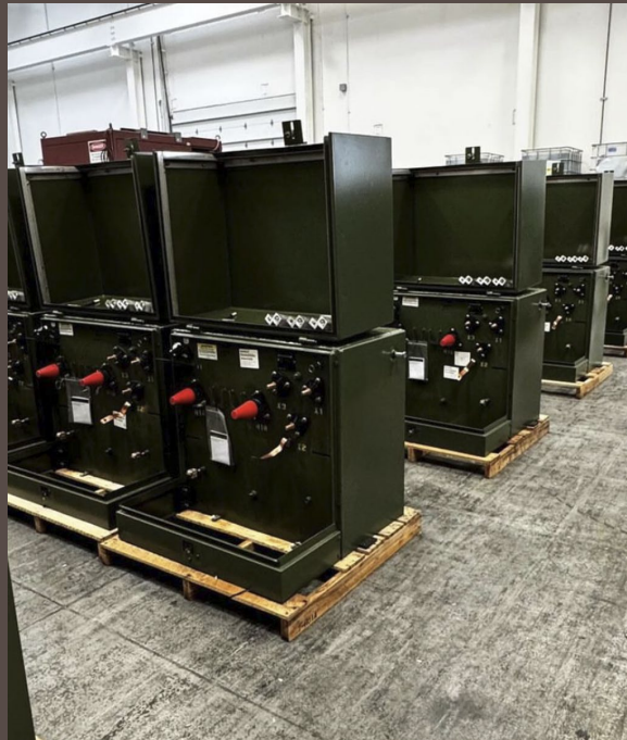
Single phase pad mounted