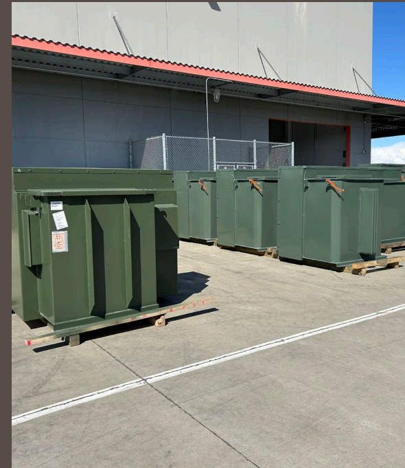
Three phase pad mounted