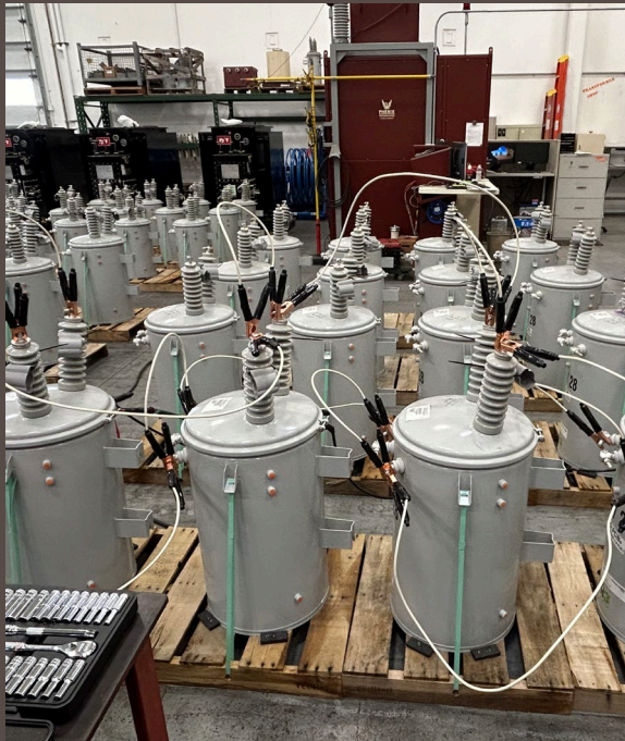
Single phase pole mounted

Seeking to establish 5-to-7-year agreements with multiple suppliers Distribution Transformers